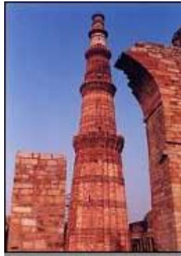
Qutub Minar, Delhi