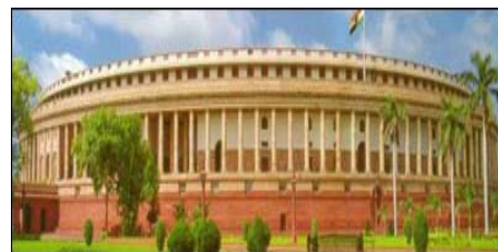
Sansad Bhawan (Parliament House)