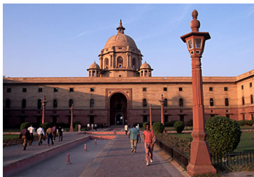
Rastrapati Bhawan (Presidential Palace)