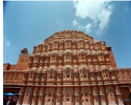
Hawa Mahal (Wind Palace)